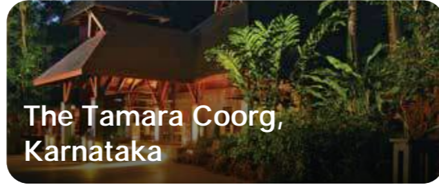
The Tamara Coorg, Karnataka

Danakil Depression, Ethiopia If aliens exist on Earth, they exist here. The Danakil Depression in Ethiopia is a weirder-than-weird piece of wonder that is the result of three tectonic plates diverging and leaving behind lava lakes, acidic springs and more. It is known as the 'hottest place on the planet', and that is no joke. Geothermal activity in summer causes temperatures to reach as high as 55 degrees Celsius.